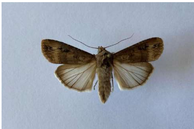
Figure 4. A. ipsilon

wing. The hindwings are whitish to gray with darker venation and a dark brown outer marginal stripe (Figure 4).