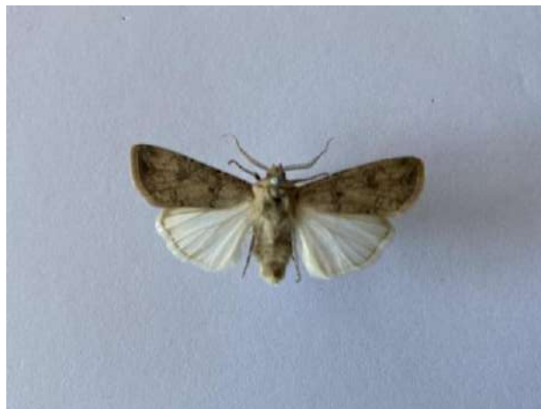
Figure 3. A. segetum

The moths have grey-brown to dark gray forewings, with characteristic spots that are often indistinct and distinct transverse dark lines. The hind wings are whitish, lighter in males, with dirty yellowish nervature (Figure 3).