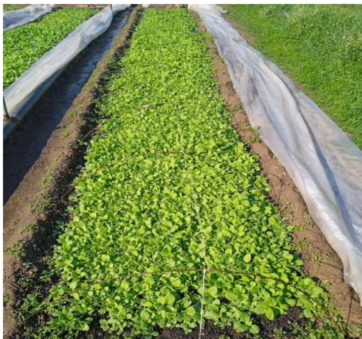
Fig. 1 Tobacco seedbed with seedlings

measuring 10 meters in length by 1 meters in width.