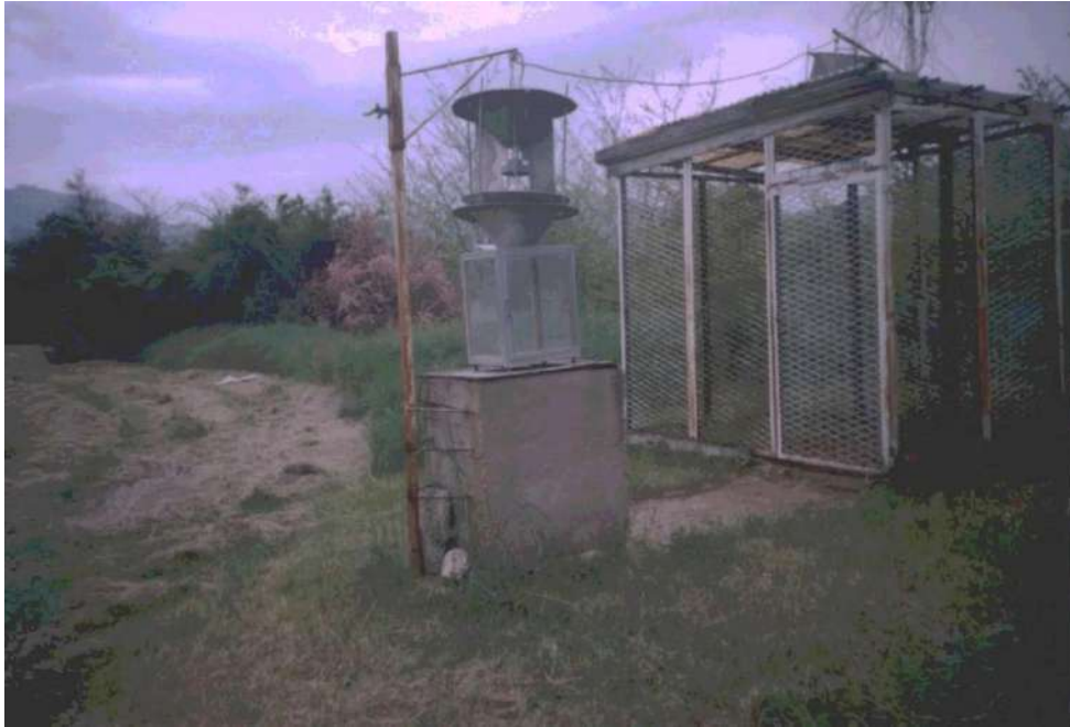
Figure 1. Light trap