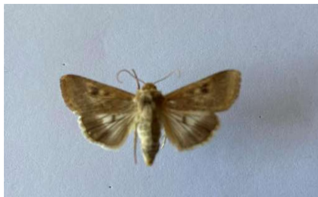
Figure 2. H. armigera

The species is represented in large quantitative numbers on tobacco plantations every year. In 2020 a total of 76 adults were caught, 74 in 2021 and 68 on 2022. The H. armigera moths were determined in the second decade of June 2020 and in the third decade of June 2021-2022, until the second decade of October 2020/21, to second decade of September 2022. In 2020 the maximum flight was first and second decade of August, and then a greater number of moths were ascertained in the second decade of September. The maximum flight of the adults in 2021 is determined in the third decade of July and the first decade of August 2021, and in 2022 maximum flight of the adults is determined in the third decade of July to the first decade of September (Table 1, 2 and 3).