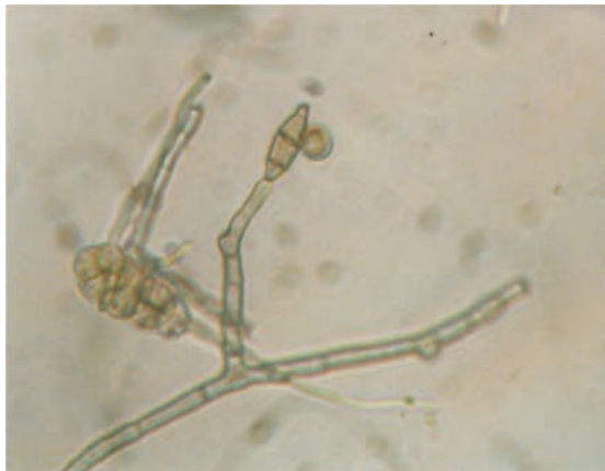
Figure 4. A. alternata – Conidiophores from spots of infected leaves

Conidiophores of the fungus of natural substrate in artificial conditions of cultivation are shown in Figures 4 and 5.