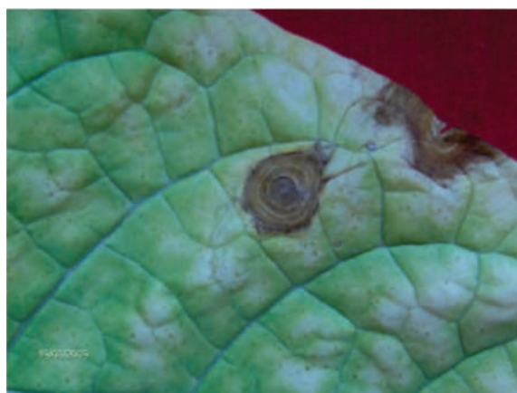
Figure 1. A. alternata - spots on infected tobacco leaf

By isolation of the pathogen from the spots of the infected tobacco leaves we got pure culture of the fungus (Figure 2).