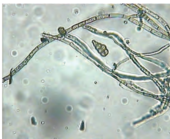
Figure 3. A. alternata – Hyphae in a pure culture

The smallest width of conidiophores formed in the pure culture is 2.80 µm, and the largest 4.80 µm. Their length ranges from 8.00-60.00 µm. In average, the conidiophores size in the pure culture is 3.78 x 31.04 µm. In the isolate V12, the high value of the length is especially expressed (Table 3).