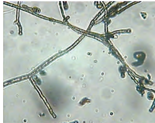
Figure 5. A. alternata – Conidiophores in pure culture

The width of conidia from the fungus formed on infected tobacco leaves is between 8.00 and 20.00 \mu\text{m} and the average value is 14.12 \mu\text{m} . The largest is the width of the conidia of B36 isolate. The length has the largest range between 28.00 and 84.00 \mu\text{m} , and the average is 55.90 \mu\text{m} . The conidia of the isolate V12 are characterized by their length, and they are almost twice the length of the conidia of other isolates (Table 4).