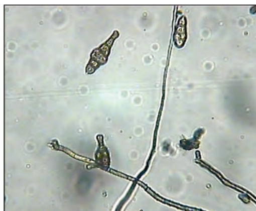
Figure 7. A. alternata - conidia in a pure culture