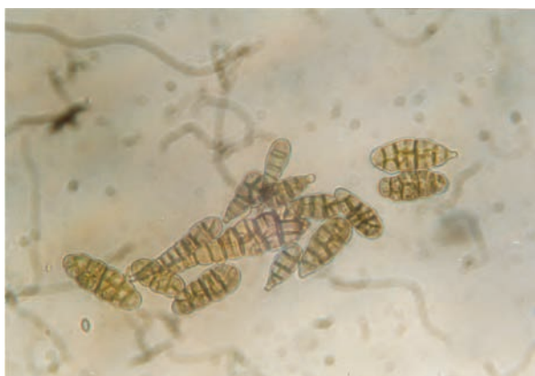
Figure 6. A. alternata -conidia of the spots on infected leaves

According to Ritz (1995), besides the good development of substances with poorer nutritive mediums, reproductive structures of A. alternata have tendency to form on rich medium. The large leaf-tobaccos of the Virginia type are characterized with high content of sugars, which had an influence on the profuse sporulation, as well as on the size of conidia on the infected leaves. In the investigations of Hubballi, (2010), the surface with the extract of a leaf of the hoist had maximum influence on the development of all 15 tested isolates of A. alternata , followed by potato-dextrose surface (KDA). All the isolates sporulated on the KDA too, but they differ in the extent of sporulation, followed by different physiognomy of the colony.