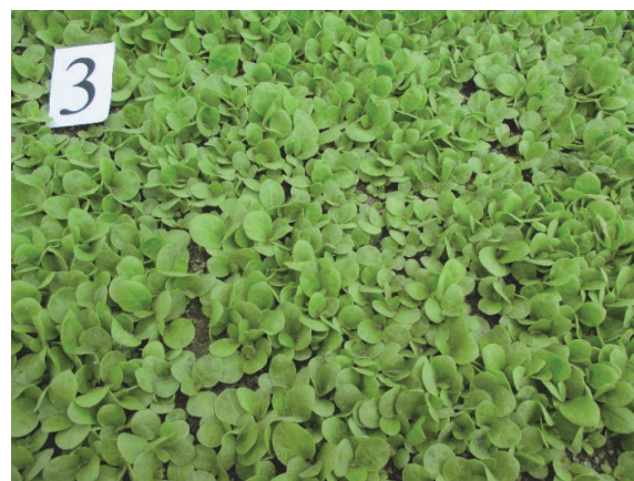
Ph 6. Seedlings in Variant 3-EmFarma Plus + Ema 5; with herbicide