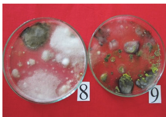
Ph 2. Presence of fungi in variants 8 and 9: seeds with EmFarma Plus + Ema 5; without and with herbicide treatment

Their number is especially important because actinomycetes are active participants in the decomposition of carbohydrate and albuminous complexes in soil (Консулоска, 1999). Hence, increased numbers of actino