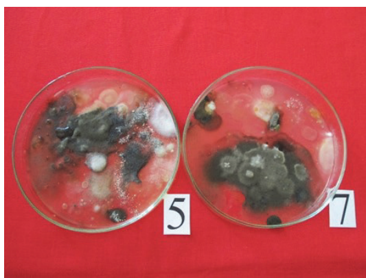
Ph 1. Presence of fungi in Variant 5- Ema 5; without herbicide and 7 - EmFarma Plus + Ema 5; without herbicide

In application of probiotics on the seed at variant 9 there is almost twice higher value than in variant 8 - without herbicide (Ph 2).