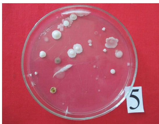
Ph 3. Presence of actinomycetes in Variant 5- Ema 5; without herbicide

mycetes along with numerous enzyme complex means providing more nutrients and destroying of pathogens.