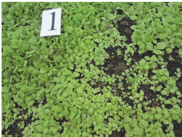
Ph 5. Intensity of damping off disease in the check

higher in soil in which there are no symptoms of disease caused by Fusarium , unlike that in which the plants suffer from the disease caused by this pathogen.