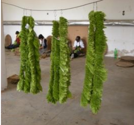
Photo 1. Green tobacco

The obtained data were processed statistically by the method of analysis of variance (ANOVA) and tested with LSD test .