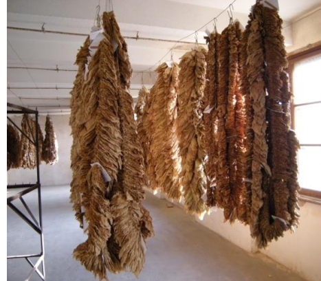
Photo 2. Dry tobacco